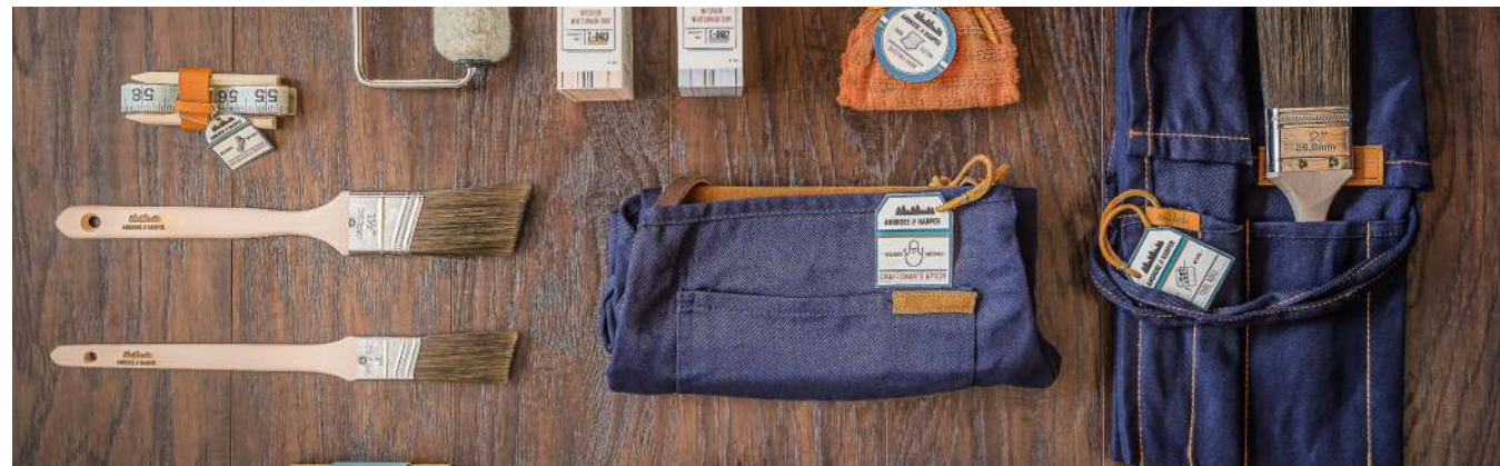
School of Graphic Design

The framework of Critical Success Factors ensures that the Strategic Plan focuses on continued academic excellence, as instructors and staff lead the institution in tandem towards Academy of Art University's 90 th Anniversary.