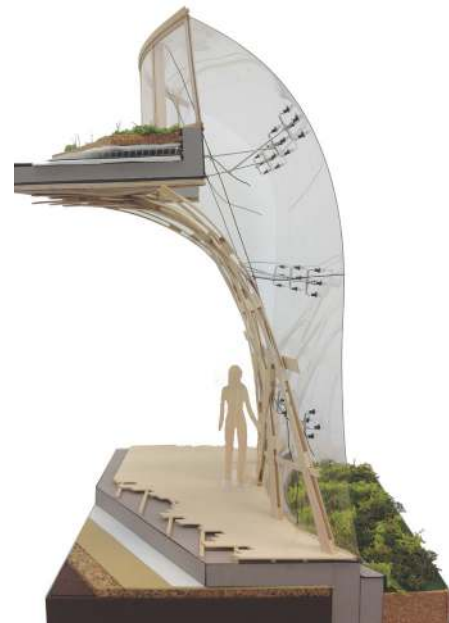
Erina Yamada, Architecture