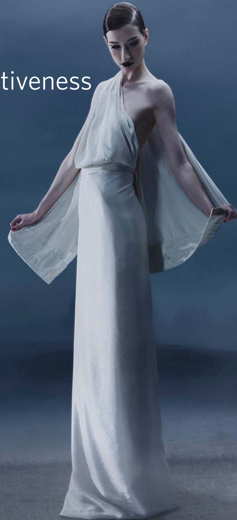
School of Photography