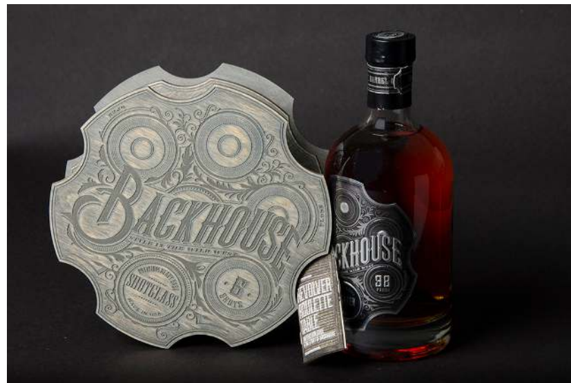
School of Graphic Design